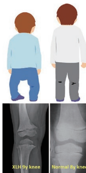
Adapted from Kyowa Hakko Kirin Group's FY2016–2020 Mid-term Business Plan

Through the process of commercializing KRN23 we are building our marketing network and strengthening our foundation to leap ahead as a global specialty pharmaceutical company. We look forward to continued collaboration within and outside the Group as we fulfill our commitment to meeting society's needs through pharmaceutical innovation.